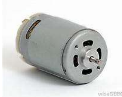
Fig3 DC Motor