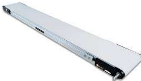
Fig.2 Roller And Conveyor

Rollers And Conveyor are used for carrying the load or material from one place to another. In this mechanism we used this roller and Conveyor for flowing the paper from initial stage to the final stage. The rollers allow weight to be conveyed as they reduce the amount of friction generated from the heavier loading on the belting Belt conveyors are the most commonly used powered conveyors because they are the most unique and the least in cost. Paper is conveyed directly on the belt so that both irregular and regular shaped or objects, small and large, light or heavy, can be pass successfully. These conveyors should use only the highest quality premium belting products, which reduces belt stretch and results in less maintenance for tension adjustments. Belt conveyors can be used to transfer product in a systematic manner or through changes in direction. In certain applications they can be used for static accumulation or cartons.