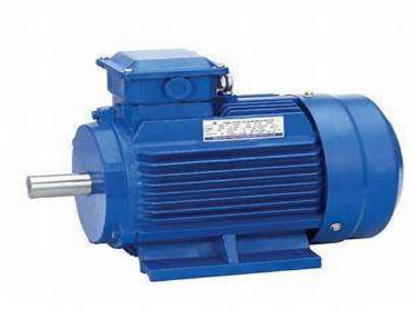
Fig4 AC Motor

Motor is an electrical device that converts electrical energy into mechanical energy. Most of the electric motors operate throughout the interface between the motor's magnification and winding currents to produce the torque in the rotation form. Electric motors can be operated by direct current (DC) sources, such as batteries, motor vehicles or rectifiers, or by alternating current (AC) sources, such as a power grid, inverters or electrical generators. An electric generator is mechanically identical to an electric motor, but operates in the reverse direction, accepting mechanical energy (such as from flowing water) and converting this mechanical energy into electrical energy.